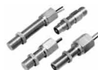
VRS Hazardous Location Series