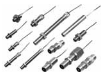
VRS General Purpose Series