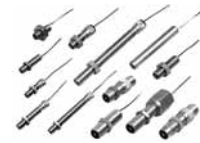
VRS Power Output Series