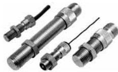
VRS High Temperature Series