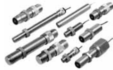
VRS High Output Series