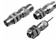
VRS High Resolution Series